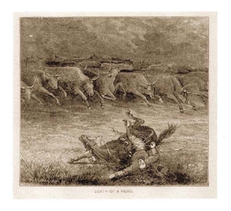
Death of a Cowboy During a Stampede