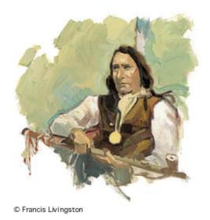
Red Cloud, the Sioux Chief