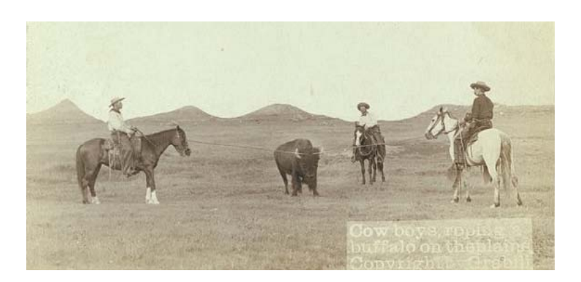
Roping a Buffalo Along the Bozeman Trail