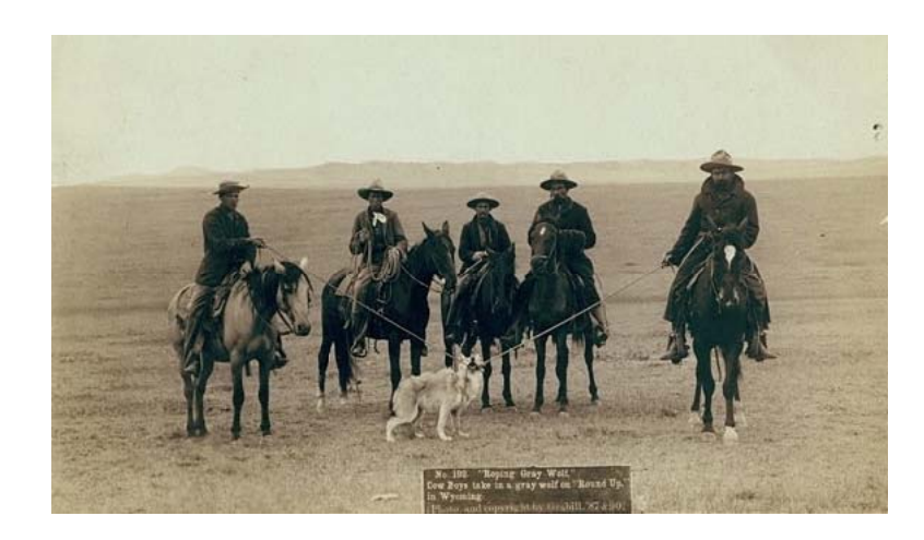
Roping a Wolf Along the "Bloody" Bozeman Trail